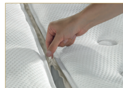
Mattresses can be joined together