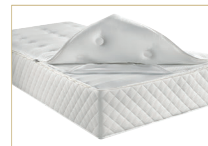
Easily removable topper